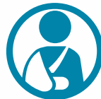
PERSONAL ACCIDENT (FOR INDIVIDUALS)